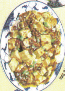
Ma Po Tofu