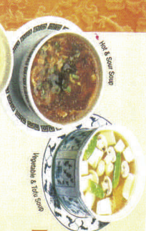
Hot & Sour Soup