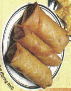
Egg Roll (Spring Roll)