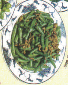
Seachuan Green Bean