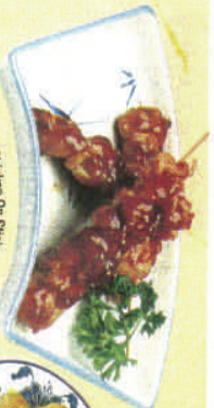
Chicken On Stick