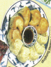
Fried and Steamed Dumplings