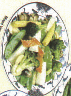
Mixed Vegetables in Wine Sauce