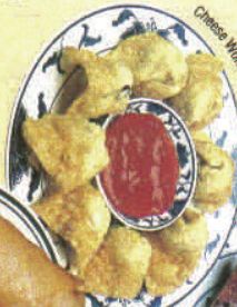
Cheese Wontons (Cai Bangoon)